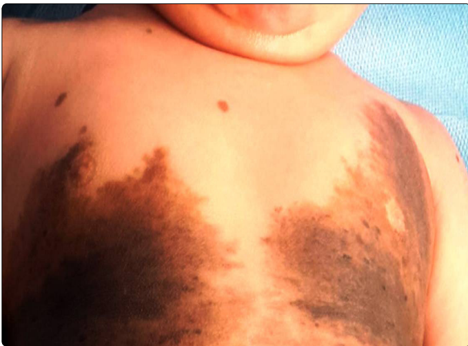
Figure 3. Giant congenital melanocytic nevus with sharp demarcation around the nipple-areola complexes.