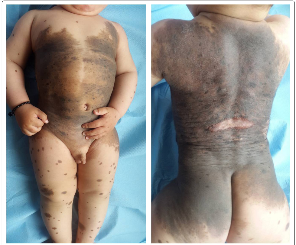
Figures 1 and 2. Circumferential giant melanocytic nevus of trunk with satellite elements.

A 9-month-old boy referred to our department for evaluation of a giant melanocytic nevus of the trunk, which appeared since birth (Figures 1 and 2).