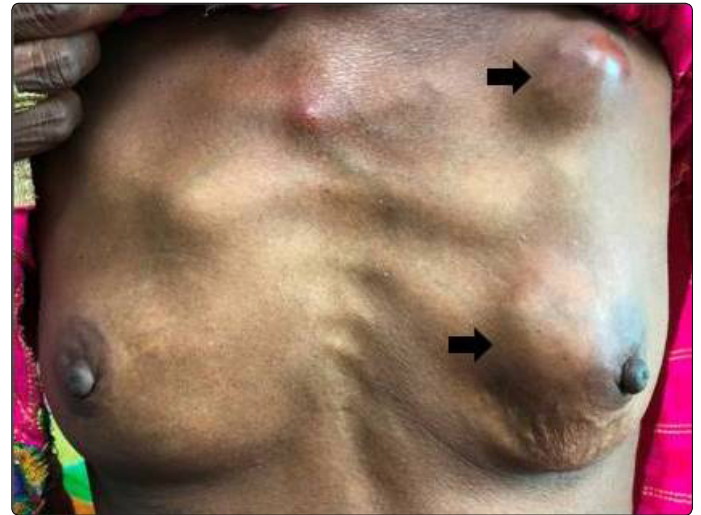
Figure 3. Left breast lump along with the nodular distant cutaneous metastasis.

conducted, revealing a lump in the left breast. The lump was located in the upper inner quadrant and measured 3 x 3 cm in size. It was hard in consistency, irregular in shape, non-tender and freely mobile over the chest wall and the skin above. The overlying skin was normal. There was no nipple or areolar discharge or any cervical/axillary lymphadenopathy (Figure 3).