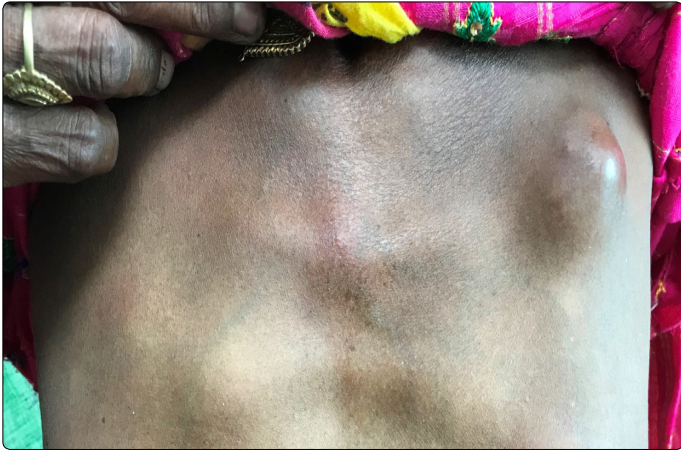
Figure 1. Solitary, round, erythematous chest wall nodule on clinical inspection.

and it was associated with mild pain. There was no history of fever but she had weight and appetite loss. Her past, personal, medical, family history was insignificant. Her physical examination revealed a solitary, round-oval, erythematous left side anterior chest wall nodule which measured 2.5 x 2 cm in size. It was firm in consistency, slightly mobile and tender on palpation. There was local rise in the temperature over the lesion and the surrounding skin was normal (Figure 1).