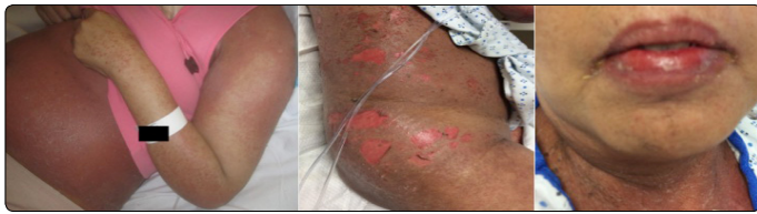
Figure 1: A woman in her 50s presenting with an erythematous, morbilliform rash with confluent papules and plaques on the trunk, back, and thighs, affecting approximately 60% BSA. Skin sloughing and mucocutaneous involvement present.

therapy. She was continued on a prednisone taper as an outpatient. On a follow-up clinic visit one month post-discharge, the patient's rash had resolved completely. Occasional hyperpigmented patches had remained on the trunk.