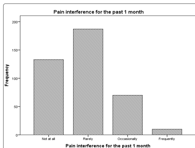
Figure 2. Incidence of Pain in the past one month

The survey indicated that 2.5% of the total population (n=400) experienced pain which interfered with their studies frequently, 17.5% of them reported that they experienced pain which interfered their studies occasionally, 46.8% of them showed pain interference with their studies rarely and 33.3% of them never experience pain interference in their studies as mentioned in figure 2.