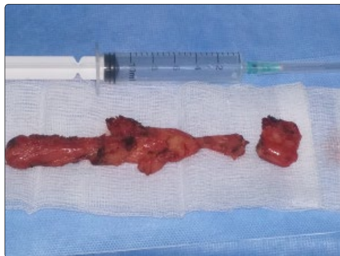
Figure 3. Exo-facial parotidectomy with tumorectomy