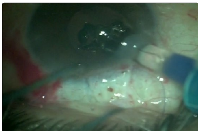
Figure 2. Shows injection of the foldable anterior chamber IOL

A peripheral iridectomy was done using Vanas scissors. The viscoelastic substance was removed from the anterior chamber with the Simcoe cannula. At the end of the procedure, a sub-conjunctival depot of dexamethasone and gentamicin was given.