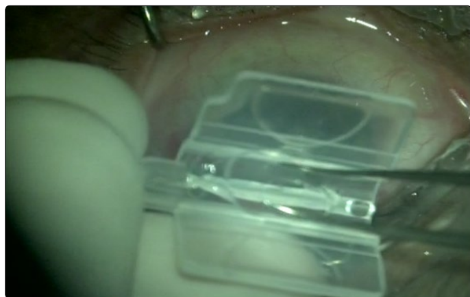
Figure 1. Shows loading of the foldable anterior chamber IOL

All surgeries were conducted under local peri-bulbar anesthesia using Bupivacaine 0.5% + Xylocaine 2%. One 1-mm paracentesis was made at the upper nasal position and one 2.80 mm clear corneal tunnel incision was made at the upper temporal position with the keratome. A viscoelastic (Viscoat, Alcon) substance was used to reform the AC. The foldable single piece acrylic intraocular lens with the angular support was then injected gently in the anterior chamber, figures (1), (2).