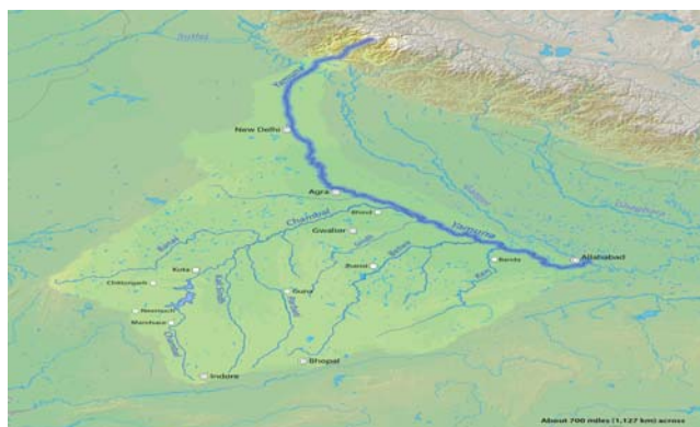
Figure 2. Map of Yamuna River

It is India's longest tributary and has also considered as the second largest Ganga tributary river. Its origination begins from Yamunotri Glacier of Banderpooch peaks in Uttarakhand as shown in Figure 2; it is stretch of about 1,376 kilometers [1]. It converges Triveni Sangam, Prayagraj though emerging with the Ganga River [3]. It passes through all major states in north India, and gets converge with other tributaries followed by Sindh, the Betwa, and Ken [7]. The river flows from Uttarakhand into the state of Himachal Pradesh [8]. It assists around 70% of Delhi's water supply [9]. It also has a mythological status like Ganga and has a spiritual standard in Hinduism [1].