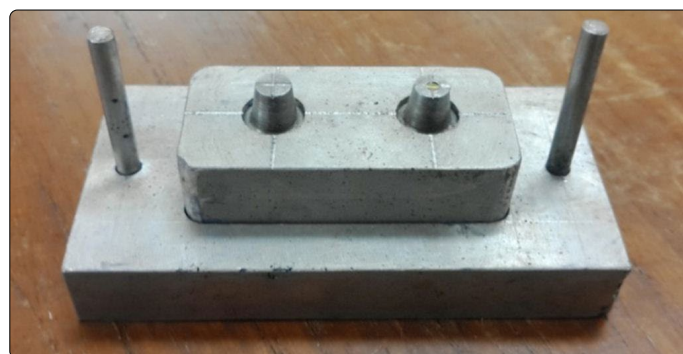
Figure 2. Master cast