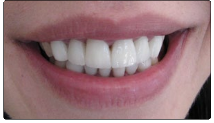
Figure 10: After the first year of use, restorations are functional and free from any complication.