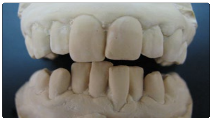
Figure 3: Diagnostic casts.

clinically by using permanent pen and the proposed final dimensions were also evaluated and approved by the patient (Figure 2). Volumes and the borders of the pulp chambers were checked radiographically. Preliminary impressions have been made with stock trays and irreversible hydrocolloide impression material (CA-37, Cavex Dental BV, Haarlem, Holland) were poured in dental stone (Gilodur, Giulini Chemie; Ludwigshafen, Germany) and the diagnostic casts were obtained (Figure 3).