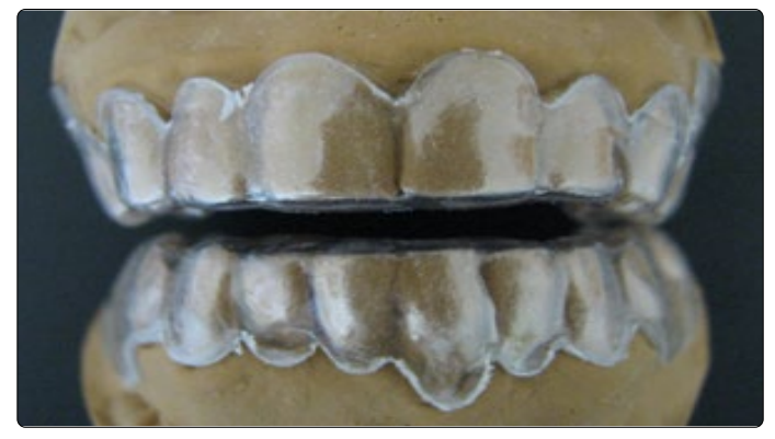
Figure 6: Clear resin templates vacuum-formed on the casts duplicated from the altered and waxed diagnostic casts.

Over-contours were eliminated under the guidance of the templates and the passive fit was obtained, required teeth were spot-etched at the mid-point of the facial surface with 37% ortho phosphoric acid (Totaletch, Ivoclar-Vivadent, Schaan, Liechtenstein) for 10 s, rinsed, and dried; templates were filled with flowable resin (Tetric Flow, Ivoclar-Vivadent) and placed. Material was light polymerized with an energy density of 480 mw/cm2 (Polofil Lux, Voco, Cuxhaven, Germany) for at least 40s from labially and palatinally after the excess material has been swept-off from the borders. Templates were peeled-out, upper and lower indirect composite mock-ups were uncovered (Figure 7).