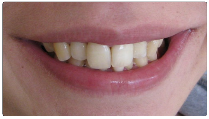
Figure 1 : Oversized and crowded anterior dentition. The deep overbite and the perpendicular incisive pathway were strictly blocking the protrusive movement of the mandible.

A 28 years-old female attended with the anterior esthetic complaints. Teeth were observed as oversized and crowded and the patient was unhappy from her unpleasant dental appearance (Figure 1). In addition to the esthetic complaints, patient has also complained from the uncomfortable chewing function. Intraoral examination revealed that the protrusive movement of the mandible was strictly blocked due to the deep overbite and the perpendicular incisive pathway. General health status was good, intraoral and radiological examinations revealed that teeth were sound and free from the carious lesions and the muco-gingival status was fair.