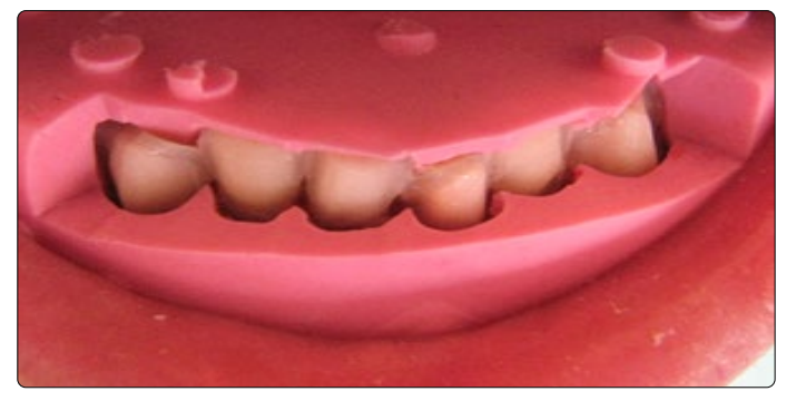
Figure 8: Elastomeric index guided preparation of the teeth.

during the entire preparation process. Dimensions and the contours of the pulp chamber were traced on the periapical radiograms, real measurements were calculated by using image measurements and the preparations were performed under the guidance of these measurements. A reliable thickness of sound dentine tissue was left on the pulpal tissue and an effective water-cooling was established on the prepared surface and bur. To obtain optimal gingival displacement, a retraction cord #00 (Ultrapack, Ultradent; Salt Lake City, UT, USA) soaked with hemo static solution (ViscoStat, Ultradent) was used.