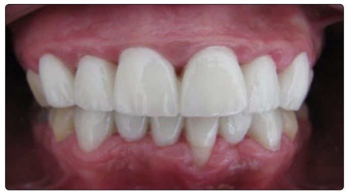
Figure 9: PLV restorations in-situ. Inciso-gingival and mesio-distal diameters were reduced, crowding was corrected, bite was diminished, incisive pathway was smoothened and the protrusive movement was set free.

performed according to the manufacturer's instructions. Excess cement was removed after 10 s of preliminary light polymerization, and the restorations were then completely light polymerized with an energy density of 480mW/cm2 (Polofil Lux, Voco) for at least 120s from all aspects of the tooth (Figure 9). The patient was instructed about the use of her laminate veneers and was recalled 1 week later to assess the oral hygiene and gingival response. Esthetic satisfaction was well addressed. Smoother and functional anterior guidance was constructed. After the first year of use, restorations are in-situ, sound, functional and free from any complication (Figure 10).