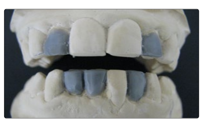
Figure 5: Additional wax-ups on altered diagnostic casts.

Desired inciso-gingival diameters of the upper and lower anterior teeth and the required reductions were marked