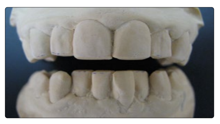
Figure 4: Altered diagnostic casts in order to reduction proposal.

Proposed reductions were made on the diagnostic casts (Figure 4), wax-up was made with sculpturing wax (Avantgarde Opaque Gray, Renfert GmbH, Hilzingen, Germany) where necessary (Figure 5) and the altered casts were duplicated in dental stone (Gilodur, Giulini Chemie) by using irreversible hydrocolloide impression material (CA-37, Cavex Dental BV). Clear resin templates were vacuum-formed and trimmed (Figure 6).