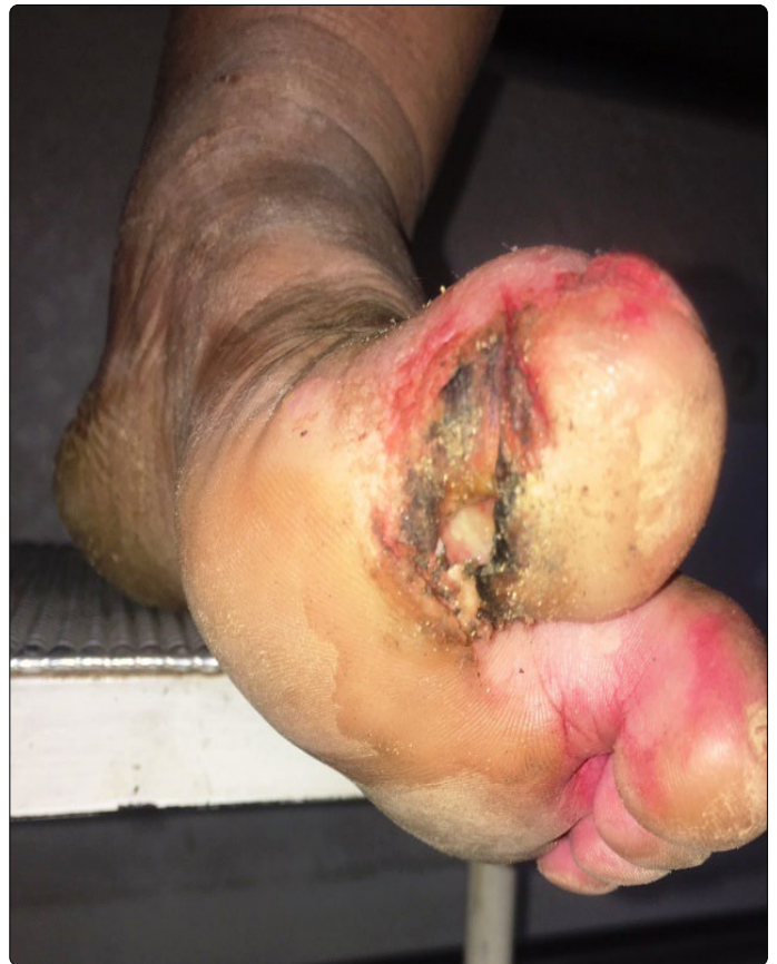
Figure 4. Ulcers on feet and swan neck deformity of fingers.