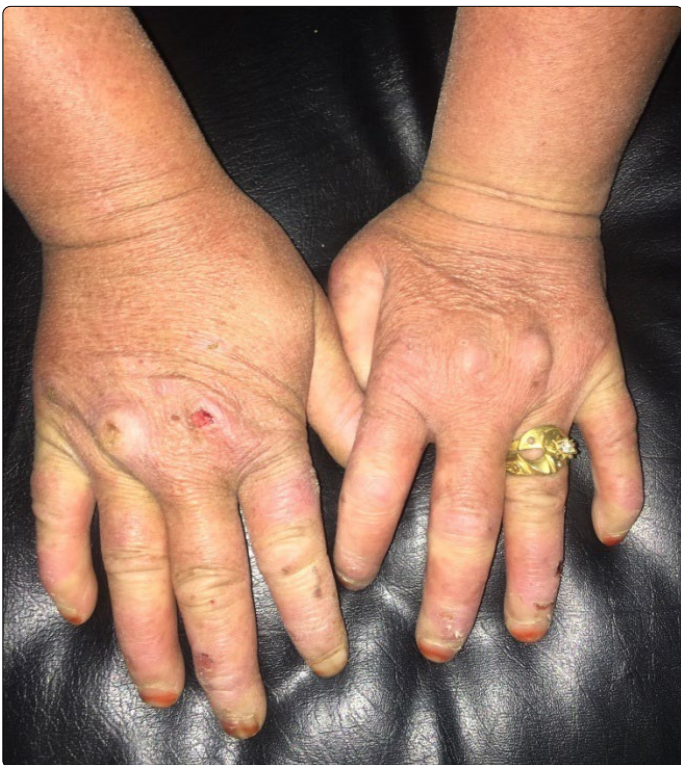
Figure 3. Ulcers on hands and swan neck deformity of fingers.