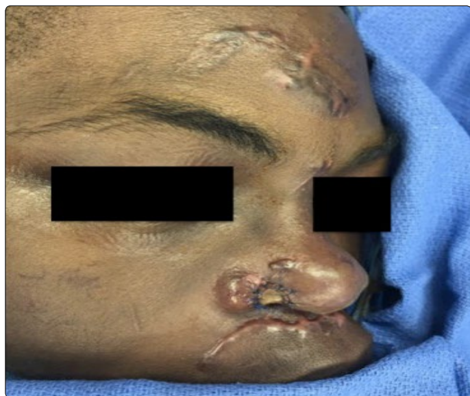
Figure 2. Intraoperative view of alar rim reconstruction with a chondrocutaneous graft from the helical root.