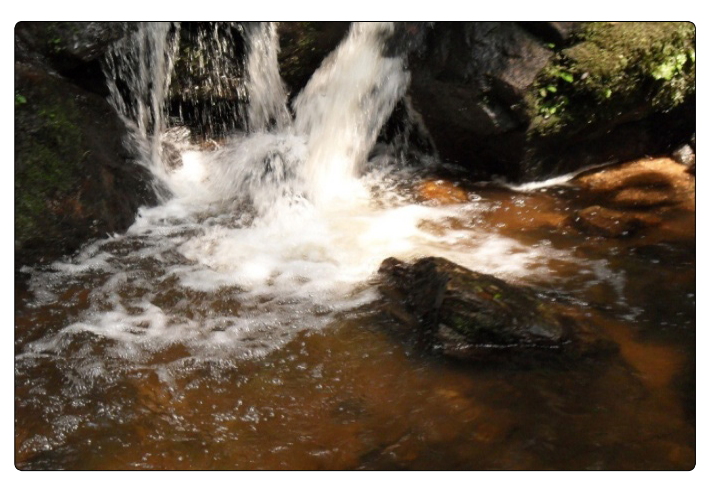
Figure 2: A layer of Olumirin Waterfalls